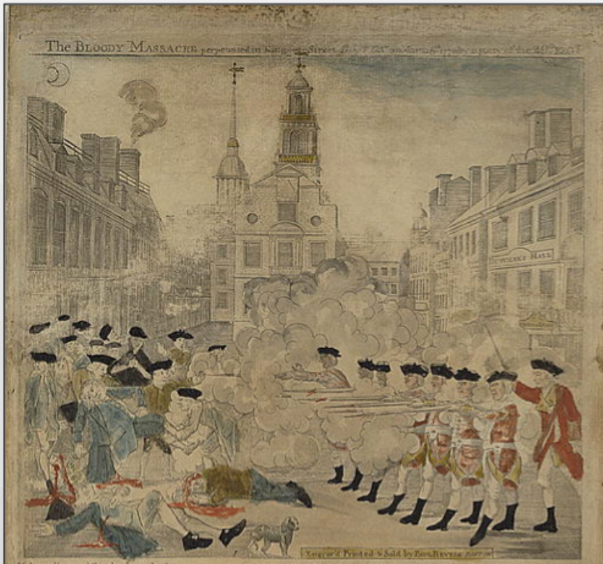
Paul Revere, March 28, 1770 The Bloody Massacre Perpetrated in King Street on March 5 th 1770 by a party of the 29 th Regiment