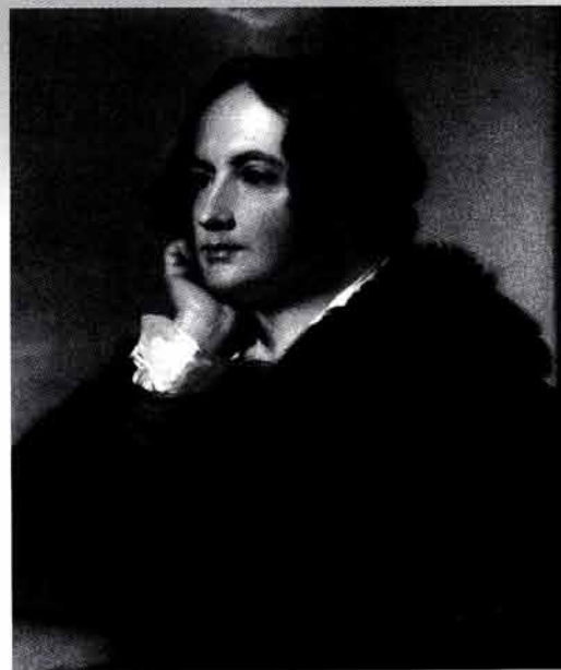
Andrew Jackson and Nicholas Biddle

IN 1791, CONGRESS OVERRODE states' rights guardians by chartering for 20 years a king-size Bank of the United States (BUS), at Philadelphia, to be funded by a $10 million public stock offering. President Washington dubiously signed on at Treasury Secretary Alexander Hamilton's insistence; and as a quasi-federal overseer of American banking, the BUS was effective and profitable throughout its term.